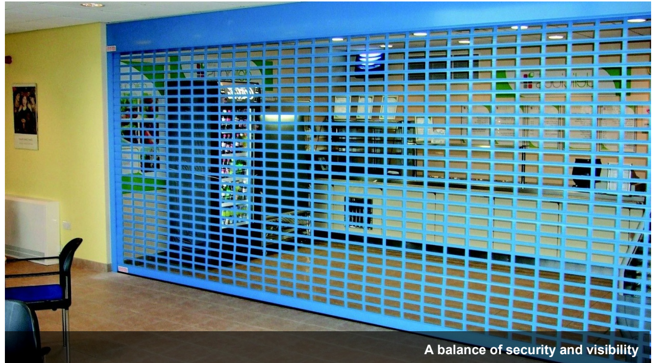
A balance of security and visibility